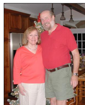
We trust you had a Merry Christmas, very Happy Holidays and we wish you good health, happiness and peace in the New Year!