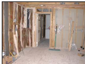
In October we started to renovate our kitchen.