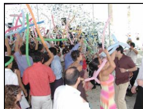
Balloons & Confetti