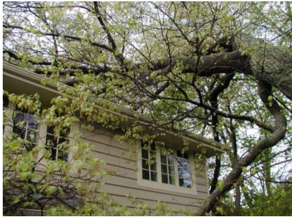
Disaster awaited us when we arrived home: our huge oak had succumbed to the wet ground and slowly tipped over onto the house. It had to be cut into sections and lifted off and/or over the house by a huge mobile crane.