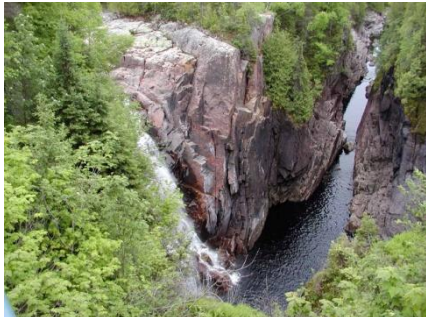
Afterwards we drove to our home in Desbarats via the route north of Lake Superior. Here we are looking down into Aquasabon River Gorge Falls.