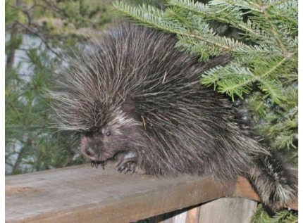
We were visited by a juvenile porcupine; cute but destructive. The railing board is a 2x6.