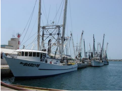
Part of the Shrimp Boat fleet seen during a yellow-tail snapper lunch at the Shrimp Shack on Stock Island.