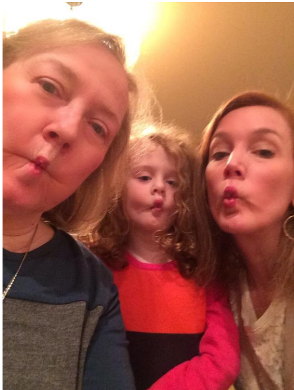
Three generations of fish faces at Thanksgiving!