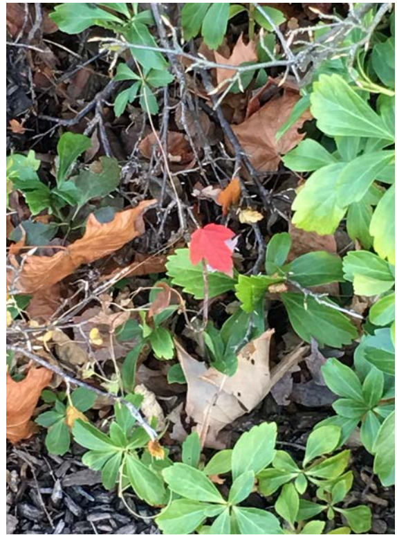
The last red maple leaf of autumn.