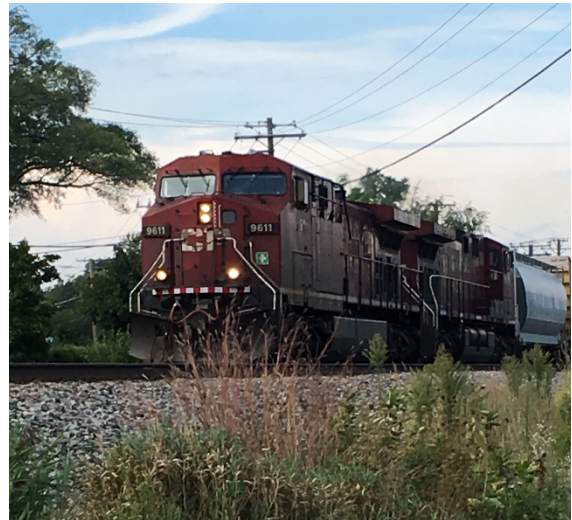
We spent many afternoons trackside at Tony's while eating subs and watching freight & passenger trains.