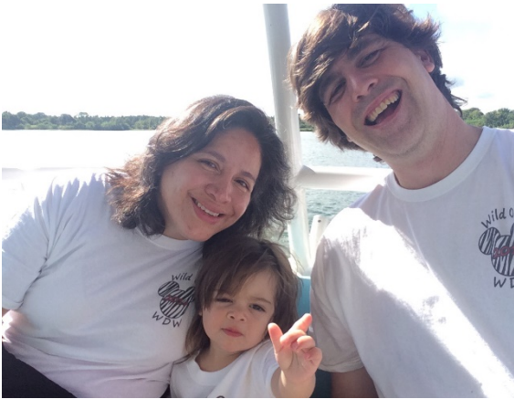
Another of the trio at Disney World.