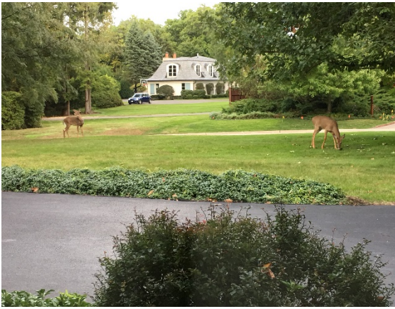
Deer from ravine nibbling our front lawn.