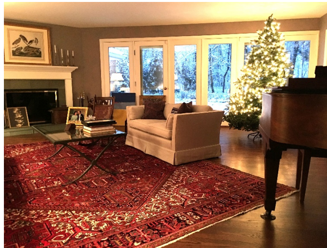
Our first Christmas tree in the new house – also the first snowfall!