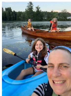
Meanwhile the Massachusetts gang paddled on the river near their home in Massachusetts.