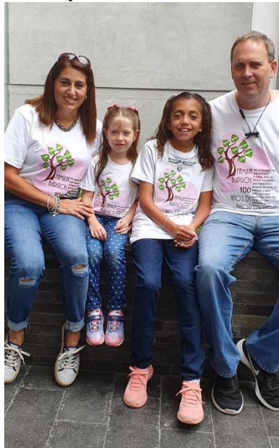
It was a very sunny day in Peru.