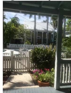
Dawn's home across the street.