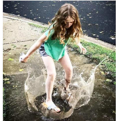
A good use of a puddle.