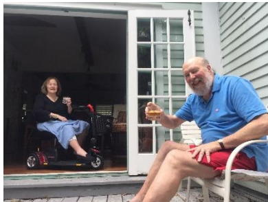
Mid-April in Key West.